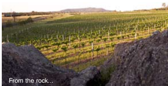
From the rock...

In Poole's Rock's case those pivotal entries are Poole's Rock Semillon 2009 'a pure-bred semillon' that top-scored 96 Points and a place in the varietal 'Best of the Best'; and its stablemate Poole's Rock Shiraz 2007 that collected 94 Points. Halliday cites his liking for its 'abundant savoury leathery regional character' and the 'long tangy palate of black fruits.'